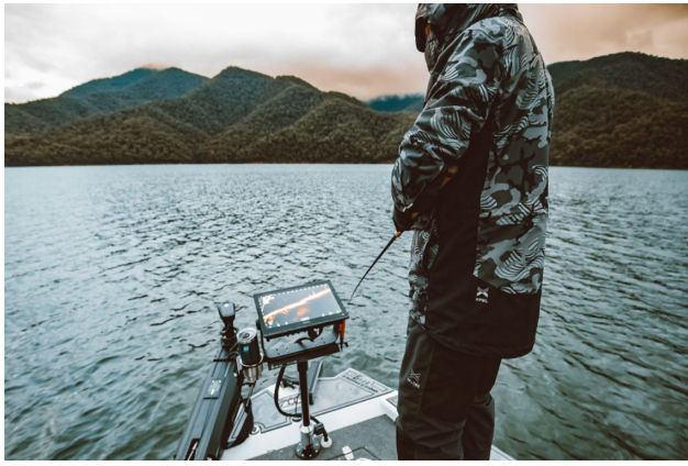
Figure 1. Angler in Australia using live sonar technology while fishing for Murray Cod.

respect include recreational-grade, commercially available live sonar (also known as live imaging sonar and forward-facing sonar) that provides unprecedented real-time imagery to help anglers locate and capture fish (See Figure 1 ; Cooke et al., 2021 ). Live sonar is often paired with other innovations, such as GPS features that allow anglers to plot their position on the water. Nowhere has the advent of live sonar been more visible than in competitive black bass Micropterus spp. events where many (most!) professionals have their boats rigged with live sonar and multiple displays to the point where their casting decks look like NASA mission control. Those early adopters are inspiring others to follow suit. Compared to older generation “fish finder” technologies, this equipment has increased the efficiency of avid anglers and created significant controversy. From anglers to fishing tournament organizers to resource managers, the merits of live sonar have increasingly become a point of discussion prompting dialogue (e.g., about “fair play”; see Hummell & Foster, 1986 ). Indeed, social media and traditional media outlets have been